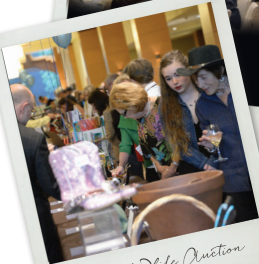
Reins of Life Auction