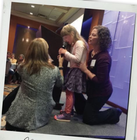
Making Strides Community Luncheon