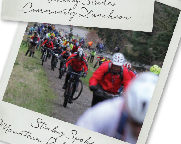
Stinky Spoke Mountain Bike Poker Ride